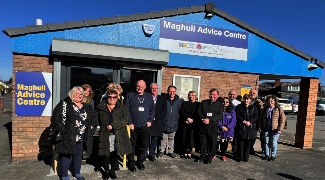
Pictured: Councillors, Officers and volunteers